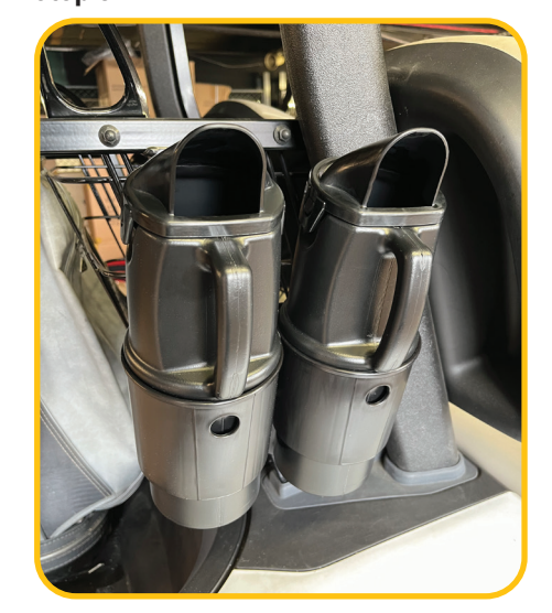
Place bottle in holder.